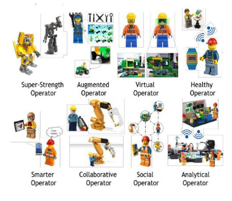
Figure 3. Operator 4.0 typology.

assistant), the Collaborative Operator (operator + collaborative robot), the Social Operator (operator + social networks), and the Analytical Operator (operator + Big Data analytics)<sup>xii</sup>. With this approach, humans remain at the centre of the production process, and technology maximises the benefits for both the company and the worker.