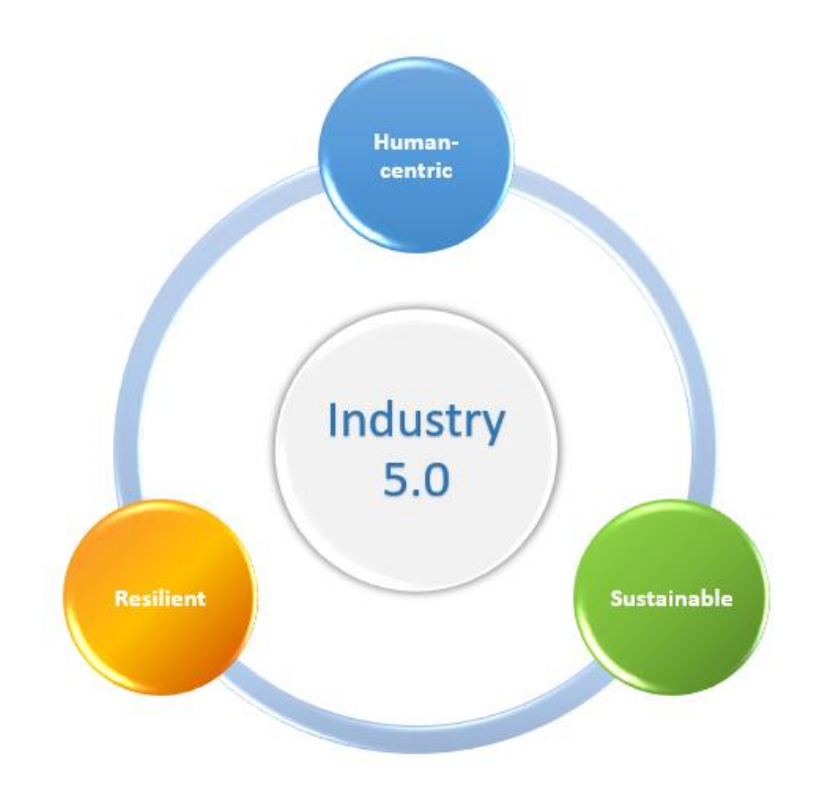
Figure 2. Industry 5.0.

A purely profit-driven approach has become increasingly untenable. In a globalised world, a narrow focus on profit fails to account correctly for environmental and societal costs and benefits. For industry to become the provider of true prosperity, the definition of its true purpose must include social, environmental and societal considerations. This includes responsible innovation, not only or primarily aimed at increasing cost-efficiency or maximising profit, but also at increasing prosperity for all involved: investors, workers, consumers, society, and the environment.