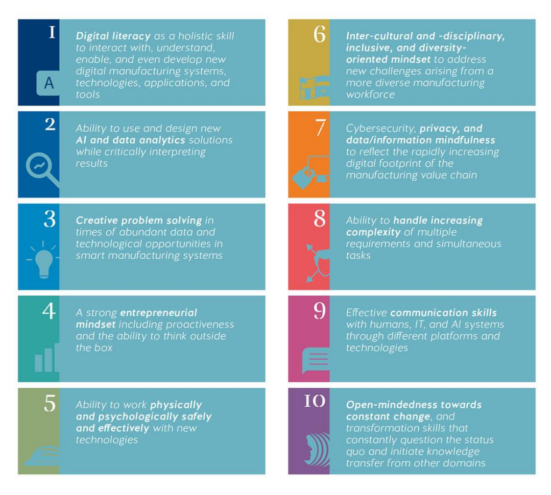
Figure 5. World Manufacturing Forum's op ten skills for the future of manufacturing

While research and innovation are key engines of productivity and competitiveness, economies and companies can also benefit by importing and adopting innovations produced elsewhere. The technology diffusion depends primarily on absorption capacity, which can be built via internal investment in skills and human capital. Companies could, and should, play a more important role in the education and training of the workforce as they have the expertise, knowledge and most direct link to technology. They know which skills are missing, and which will be required in the future. Workers should meanwhile be encouraged to participate in the design of trainings, to make sure trainings are relevant and adapted to their audience.